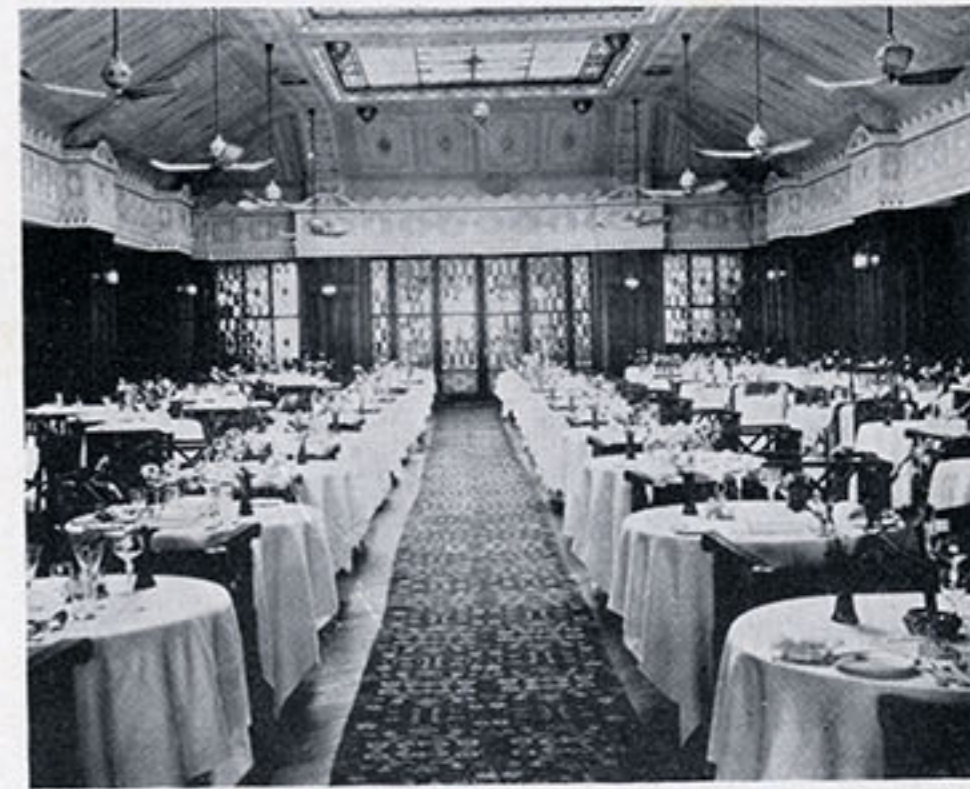
The dining-room is spacious and airy

THE HOTEL is in the Legation quarter, as that district surrounding the varied Legations is known. This section is under joint control of the "foreign" representatives. The hotel is well and favorably known to all visitors as the only hotel within the Legation walls and the scene of many of the important social functions of the diplomatic corps. Renovated and improved throughout within the past year, it presents the same facilities for the comfort of travelers as is found in the first-class hotels of New York or London with an atmosphere and flavor all its own. Its cuisine is unequalled; its service in all departments satisfactory; its sleeping chambers delightful; and its numerous public rooms spacious, cheerful, and inviting. Among the