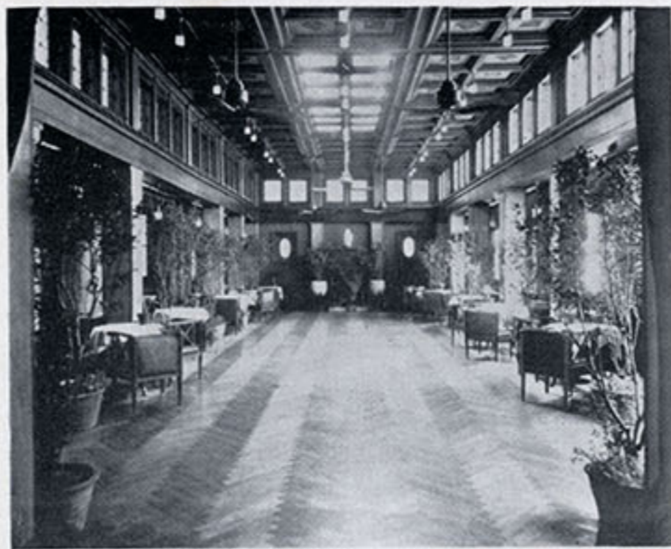
The ballroom where tea and dinner dances are held