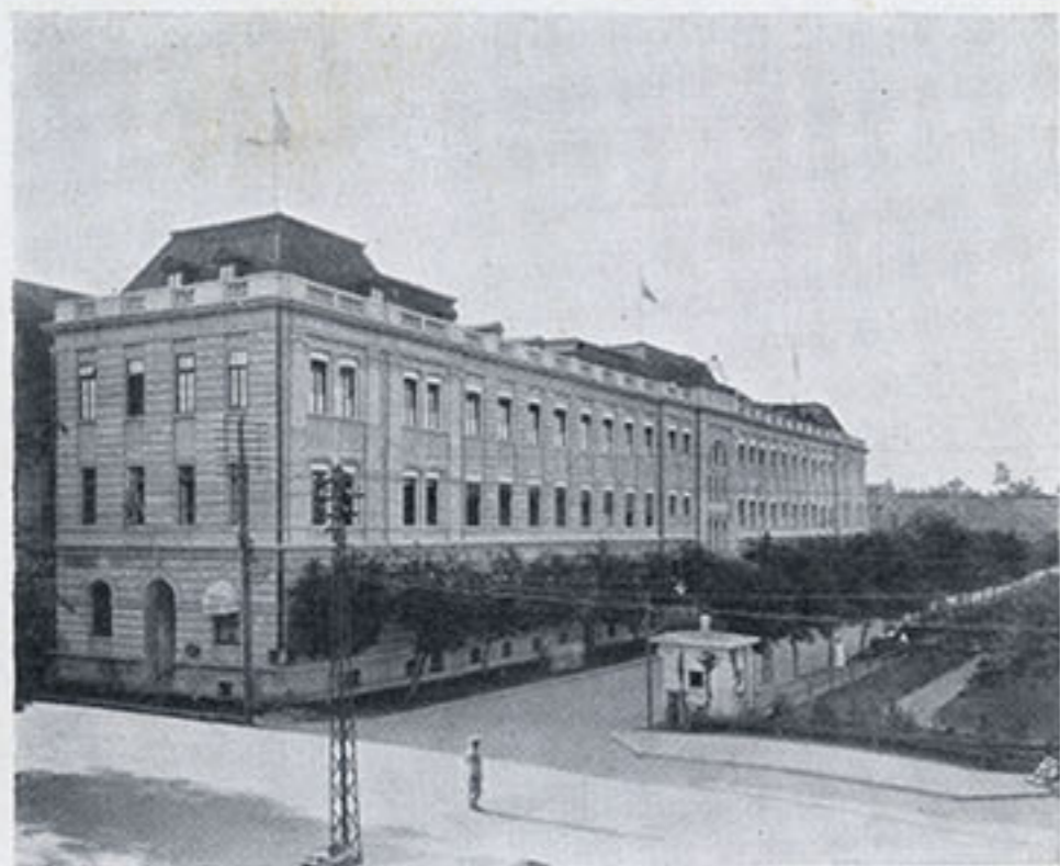
Grand Hotel des Wagon Lits, in Legation Quarter